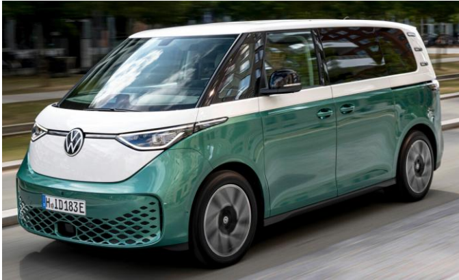
Volkswagen ID.Buzz.