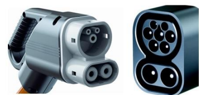
CCS2 charging plug and socket

The EQC is fitted with a CCS2 socket allowing it to charge via Type 2 AC chargers as well as via CCS2 DC fast-chargers.