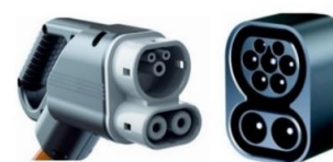
CCS2 charging plug and socket

The Cadillac Lyriq is fitted with a CCS2 socket allowing it to charge via Type 2 AC chargers 1 as well as CCS2 DC fast-chargers.