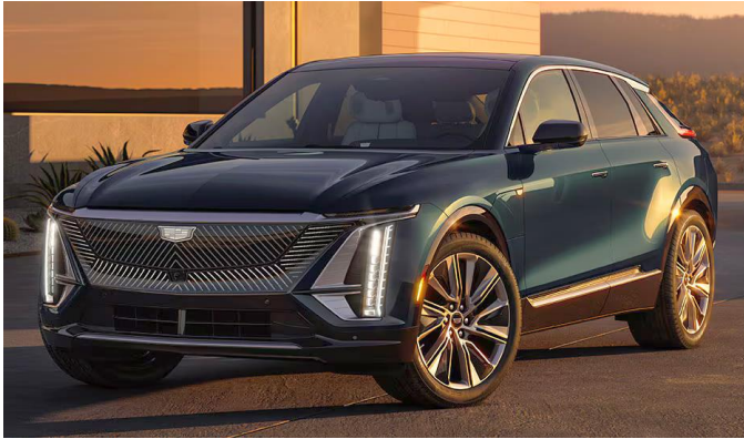
Cadillac Lyriq.