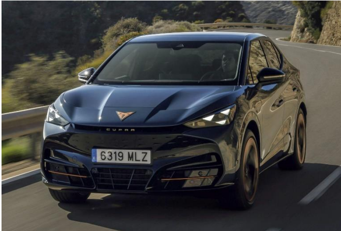
Cupra Tavasca.

Created and written by: Bryce Gatton Contact: Bryce@EVChoice.com.au