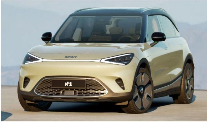
Smart #1.

Created and written by: Bryce Gatton Contact: Bryce@EVChoice.com.au