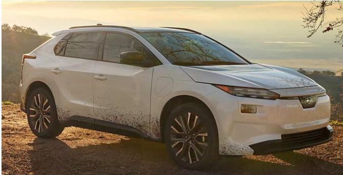
2026 update Subaru Solterra.