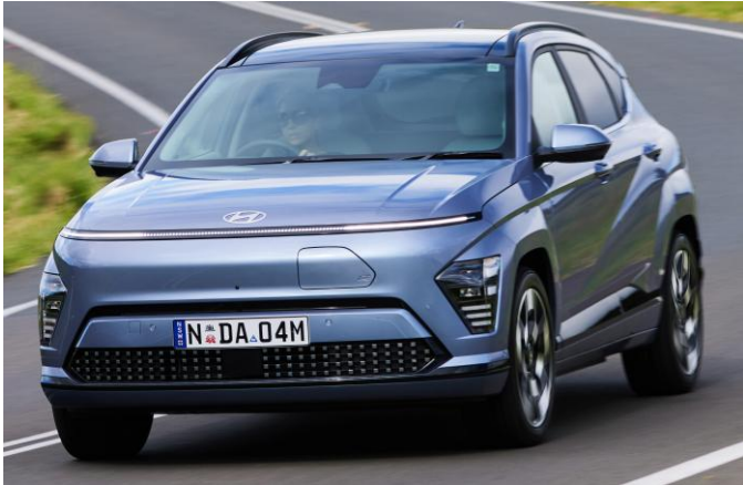
2024 Hyundai Kona electric.