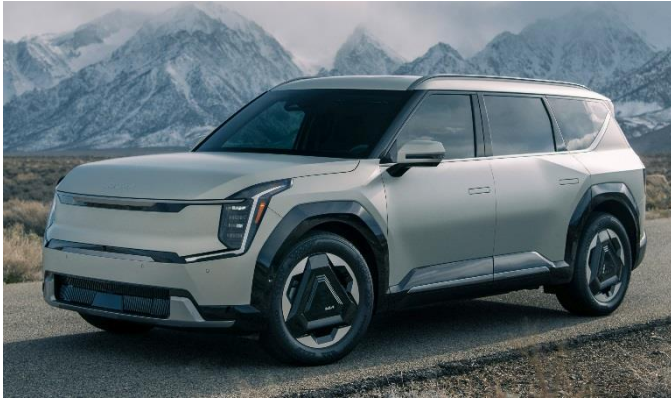
Kia EV9