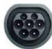
Type 2 AC socket

Note: CHAdeMO leads are being phased out in some countries already, although they will likely be available at most locations here for the life of a new UX300e bought today.