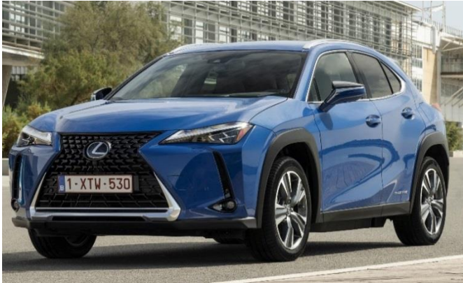
Lexus UX300e.