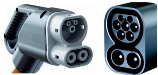
CCS2 charging plug and socket

The GV60 is fitted with a CCS2 socket allowing it to charge via Type 2 AC chargers 2 as well as via CCS2 DC fast-chargers.