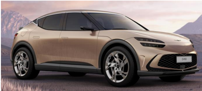
Genesis GV60.