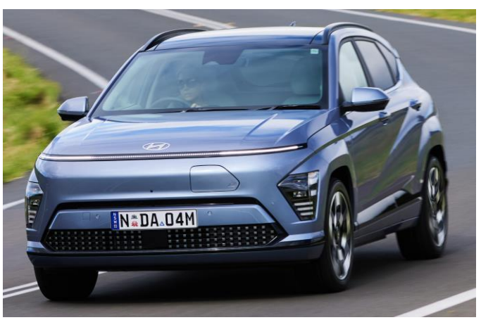
2024 Hyundai Kona electric.