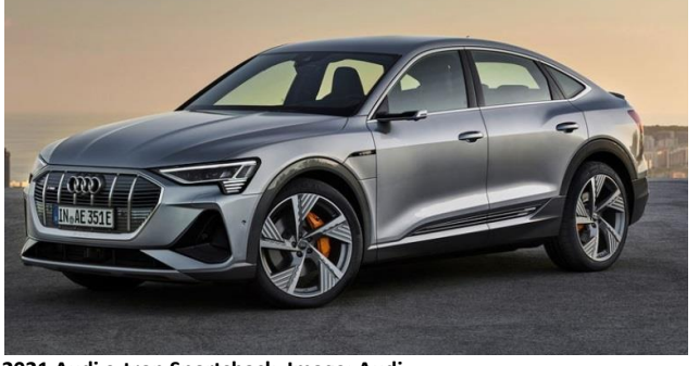
2021 Audi e-tron Sportsback.