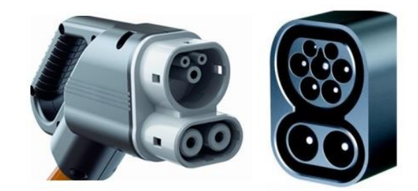
CCS2 charging plug and socket

The Audi e-tron is fitted with a CCS2 socket allowing it to charge via Type 2 AC chargers<sup>2</sup> as well as CCS2 DC fast-chargers.